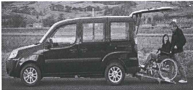
ZONE 4 TYPE HIGH SEATING POSITION

By adopting the 100% wheelchair accessible taxi policy, you will be discrimination against the very people that the Disability Discrimination Act was supposed to help. Most wheelchair users can transfer from wheelchair to saloon car but have great difficulty with WAV because the seats are at a greater height than the wheelchair (wheelchair height 465mm wav seat height 750 mm + _