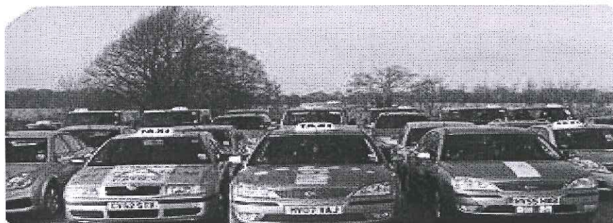
: saloon taxis type Shropshire zone 1,2,3,5

Not all disabled people are in wheelchairs. More than 20 million people in this country, including many whom are young and look very fit, have arthritis. Many of these would find it difficult to get into a Shrewsbury and Atcham ZONE 4 Type WAV.